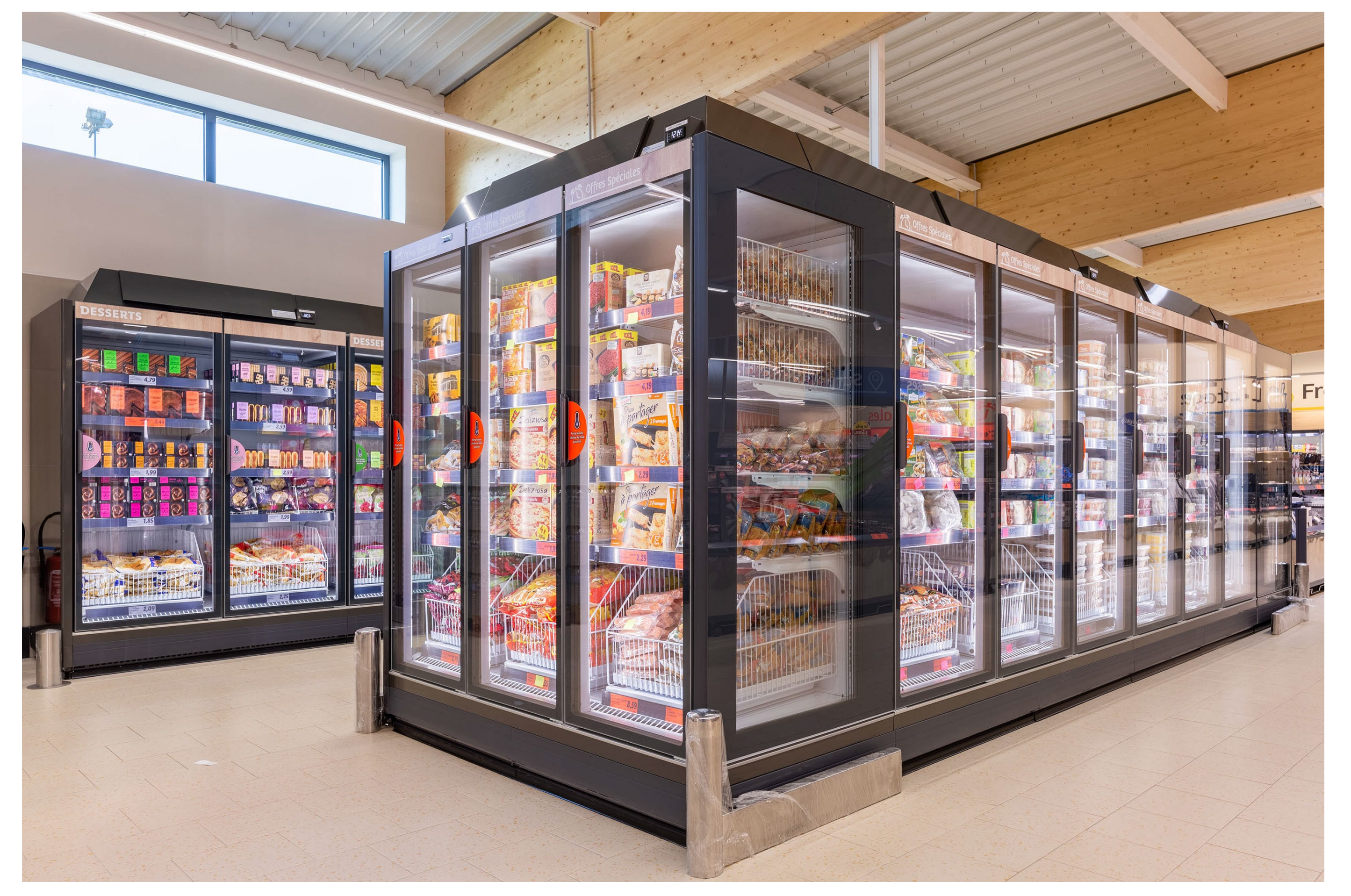
GranBering Intregal Ultra island with end of line 3DS