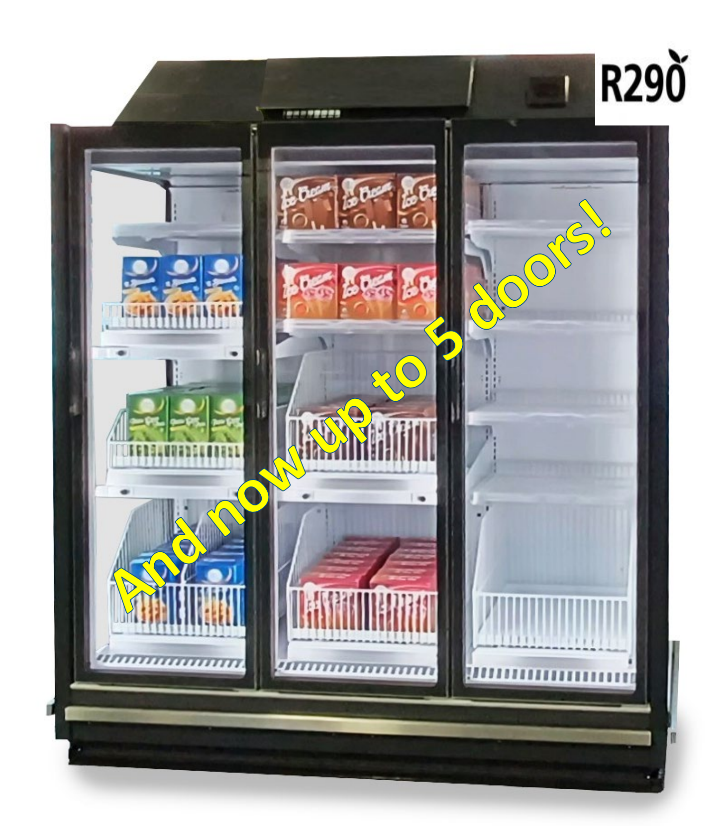
New GranBering Integral Ultra

Compared to previous generation, GranBering Integral Ultra offers up to -30% energy saving, more smart display solutions and an enlarged offer of customizations.