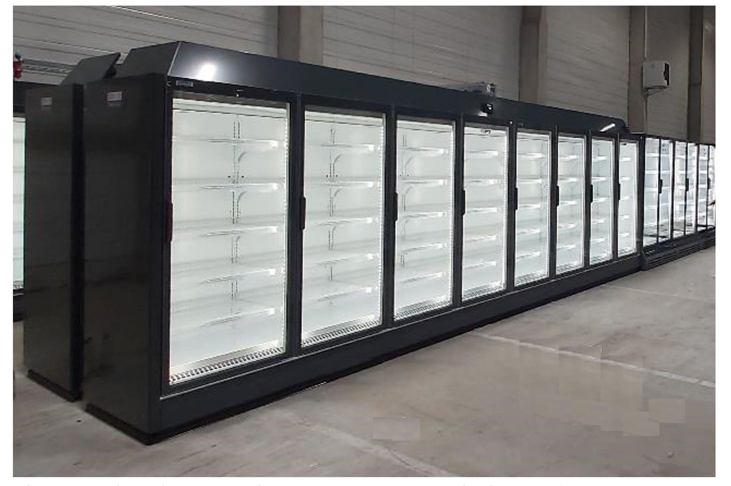
Dark store wharehouse with GranBering Intregal Ultra and GranVista Integral