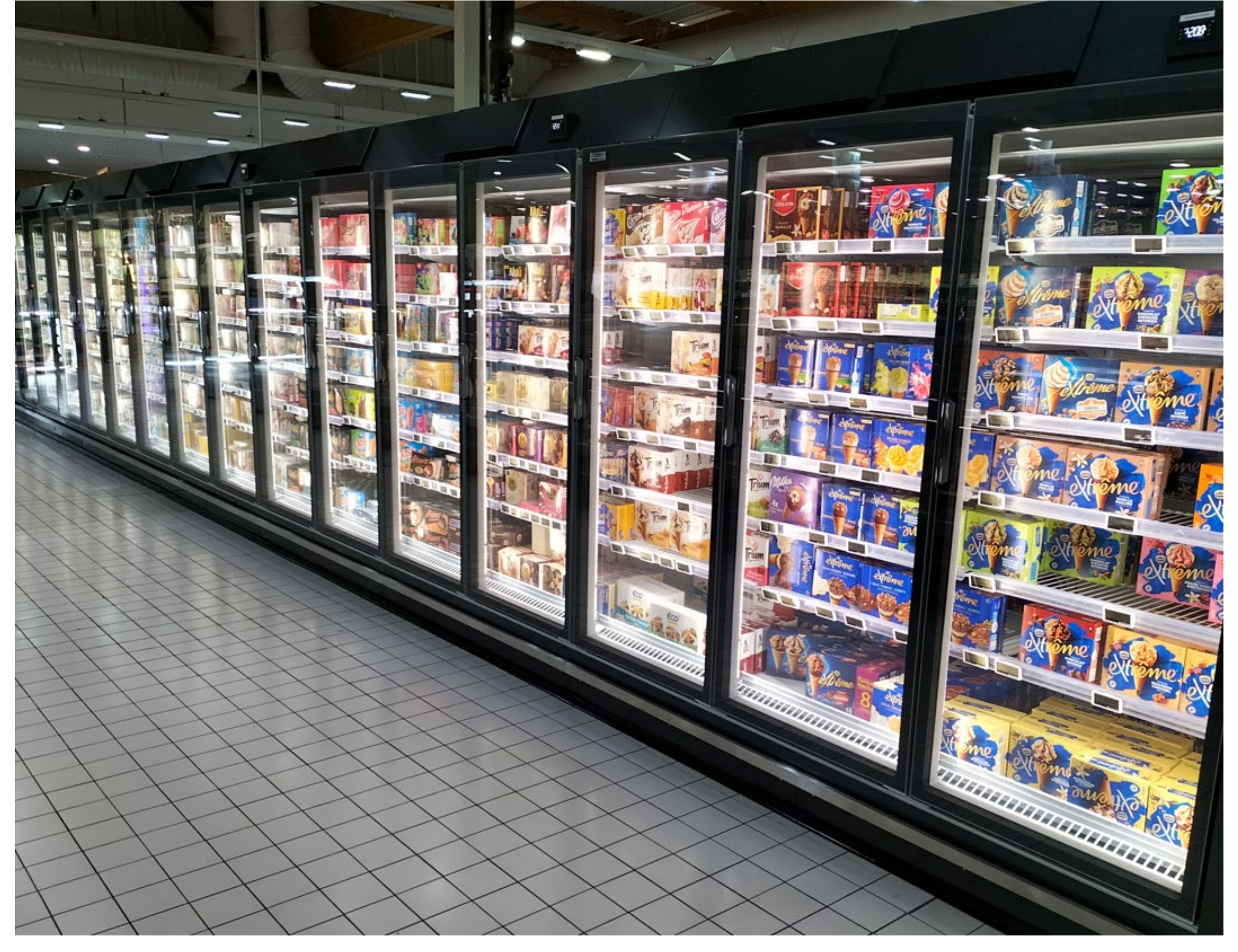
GranBering Integral Ultra 17 doors linear